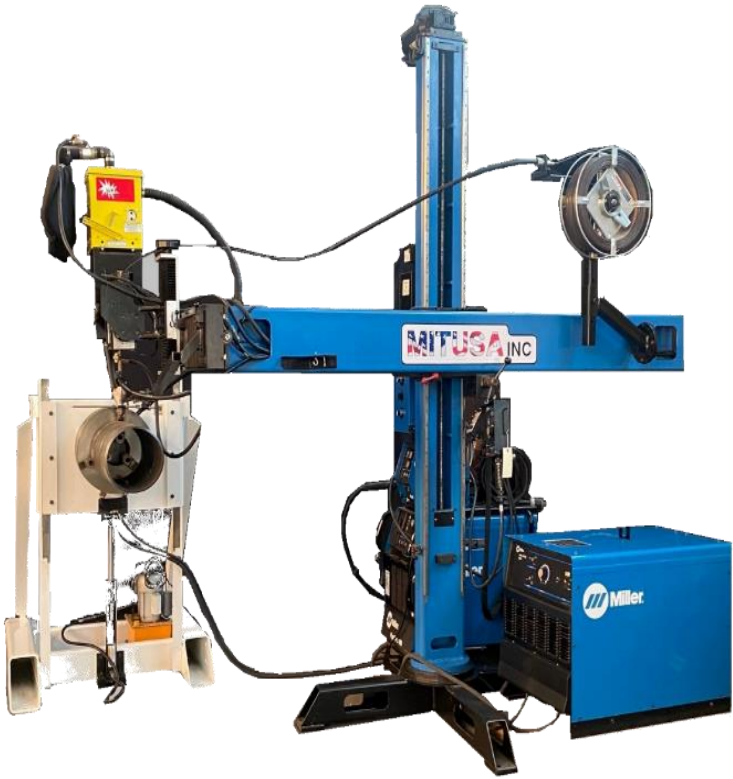
MITUSALATOR Unitized Column and Swivel Boom Welding Manipulator

6161 Maywood Avenue Huntington Park, CA 90255 USA Tel: (323) 312 - 2022 Fax: (323) 582 - 7786 info@mitusaproducts.com www.mitusaproducts.com